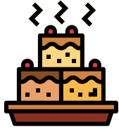
BOX BROWNIE MIX